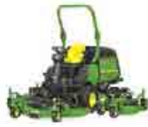
1600T SERIES III WIDE-AREA ROTARY MOWER